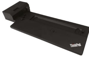
ThinkPad Pro Docking Station