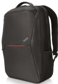
ThinkPad® Professional 15.6" Backpack