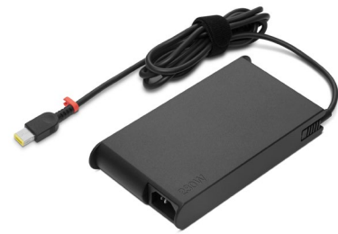
Slim ThinkPad 230W AC Adapter