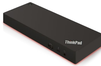
ThinkPad® Thunderbolt™ 3 Workstation Dock Gen 2