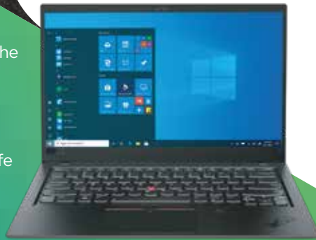
ThinkPad® X1 Carbon

of PC parts returned to our service center will be repaired for future use. 2