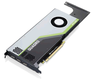
NVIDIA® Quadro RTX™ 4000